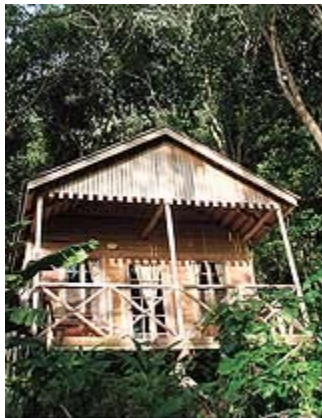
One of the cottages designed and built from residents using hardwood from the area.

And that's exactly how Dominica is trying to sell itself. The small Caribbean island has created a master plan to become a major ecotourism destination. It has plans to build more environmentally friendly attractions, and now has ecotourism classes in its high schools.