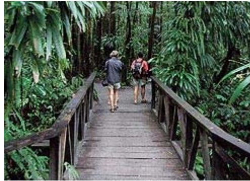
A bridge to the Emerald Pool.

Though there are certainly many natural wonders in Dominica, some claims made in the name of ecotourism are exaggerations. The nation's tourism office boasts that the island has more than 20 centenarians, a tribute to the healthy eating on the island. One celebrated woman in Dominica was allegedly 128 years old when she died in 2003. Gerontology researchers say that claim is untrue.