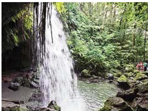
Tourists at the resort can swim in the Emerald Pool.

Vegetation grows swiftly in Dominica. Last year, at Jungle Bay's outdoor restaurant, a guest threw a cayenne pepper over the balcony to the ground below. Now, there's a giant pepper tree, with hundreds of peppers available for use in the restaurant. It's as if someone tossed a soft-drink can to the sidewalk of a U.S. city, and a Coke machine quickly rose up to dispense a never-ending supply of refreshments.